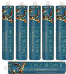
The GOAT® Liquid Airtight Grommet 310ML