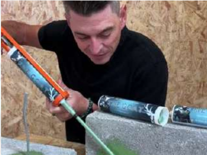
Application around a cable

The GOAT® Liquid Airtight Grommet easily adheres to rough surfaces, forming a complete seal around pipes, cables or conduits. Our Liquid Airtight Grommet is applied directly over or around the penetration point using a cartridge gun. It adheres to the surface and, as it cures, forms a seamless, airtight barrier that expands and contracts with the building over time. It's designed to withstand temperature changes, humidity, and building movement, ensuring long-lasting protection.