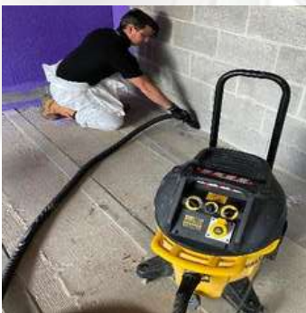
Vacuum all debris.