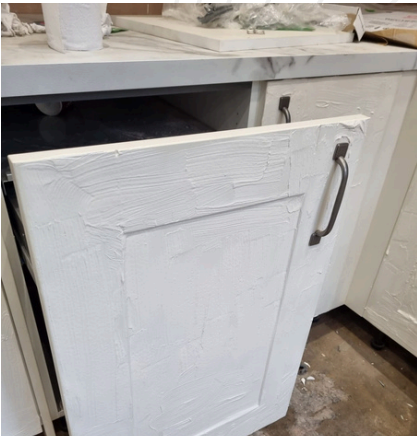
5.1.2. Kitchen cupboard