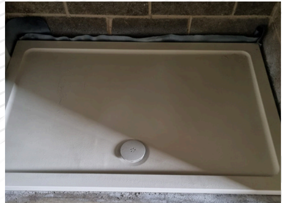
5.1.6. Shower tray