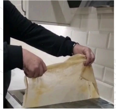
5.1.4. Peels off after use