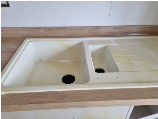
5.1.5. Sink and draining board