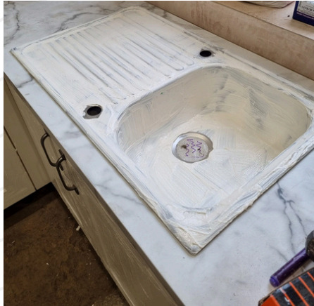
5.1.3. Sink and draining board